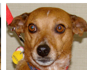
Tripp HSWA Alumni