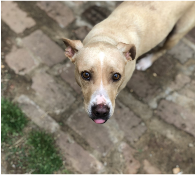
This terrier mix sure knows how to ham it up for the camera.