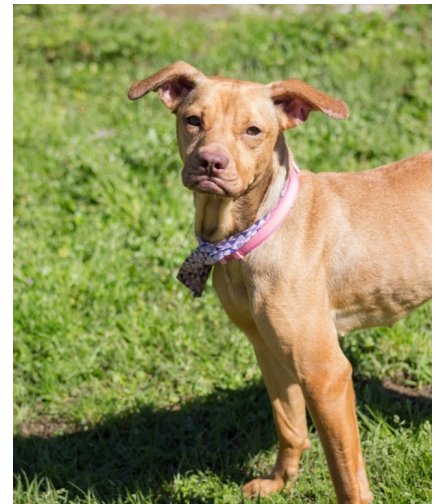
How could you possibly resist that pout?