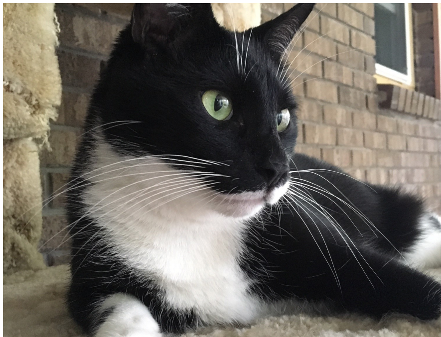
Tux on the Cat Adoption Center's "catio" enjoying some fresh air and bird-watching.