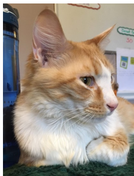
Curley has a great smile!

Tux is a devilishly handsome kitty who is searching for his forever home. His humans will have to be very cat-conscious because Tux is an extra special boy. He's an Alpha Cat, but he loves to nuzzle people, rub their ankles, and he even knows how to sit for treats! But did you know that – like humans – cats can be affected by mental illness? Through no fault of his own, our Tux has some wires crossed in his brain and, as a result, has some anxiety issues. He is being treated with "kitty Prozac" (just a little ointment rubbed in his ears once a day – very easy! ) to help him stay calm. To live his best life, Tux needs a home without small children and a large screened-in patio to watch the birds. If you fit the bill, fill out our adoption application at humanesocietyofwa.org today!