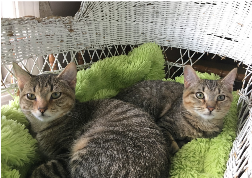
Twins Chloe and Zoe are just two of our tiny tabbies available for adoption.