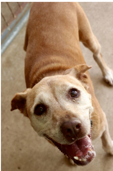
"Age ain't nothing but a number!"