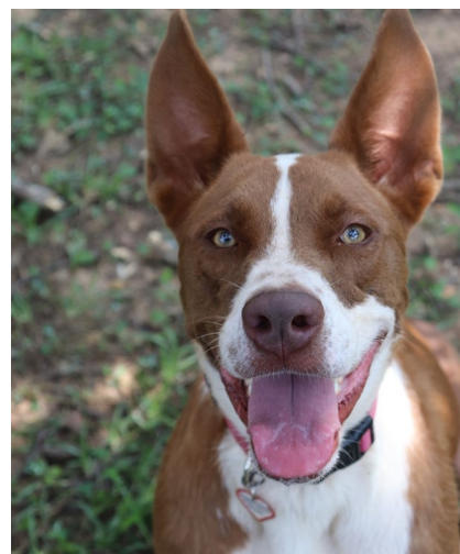
"Hey, throw the ball already, will ya!?"