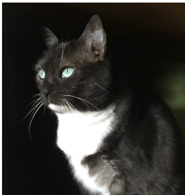
Boots has STUNNING emerald eyes.

Boots has long been a kitty known for being a total grumperpuss. As it turns out, there was a reason! The poor thing was diagnosed with an especially bad case of Irritable Bowel Disorder. Her tummy troubles were causing her to be in near-constant pain. Try as we might with various medications, we couldn't figure out a way to regulate her digestive system. But thanks to our Cat Specialist Veterinarian, we were able to try something total new: a fecal transplant!