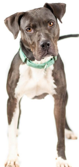
Sugar is just as sweet as her name suggests.