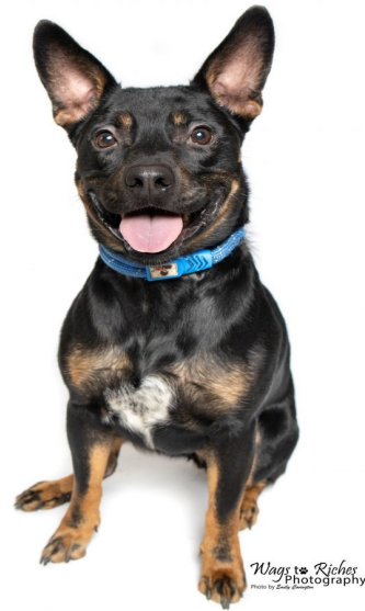
Holly is tiny, but mighty!