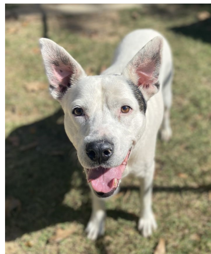
Taren is ready to go for a W-A-L-K.

If you're interested in adopting Taren, or any of our dogs, please get in touch by email or phone. All HSWA dogs are either at our Dog House or in foster homes. All animals require an appointment to meet.